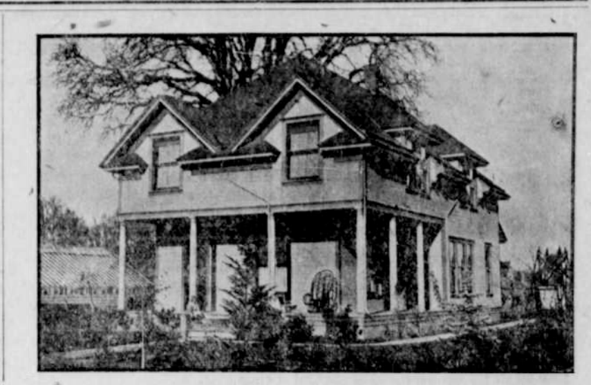
One of Forest Grove's Handsome Residences