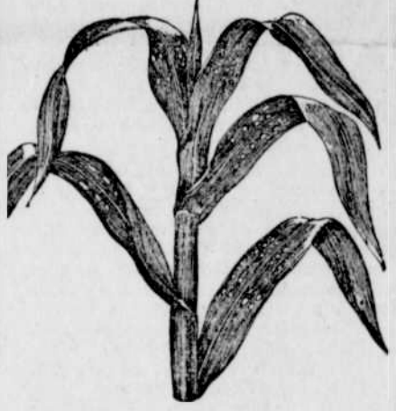
Mutilation of leaves of corn caused by larvae of larger cornstalk borer.

Rotation is one of the best general preventives of injury from insects affecting field crops. Experience has shown that where corn has followed itself upon the same field for two or more years there has been a much