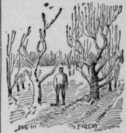
Fig. 1. Attempt at Working Over Old Transcendent Crab Tree, Showing About as Good a Selection of Stubs as Is Possible With Such a Subject.

The important point in grafting is to see that the cambium layers of the stock and the scion are matched at some point. When the growth is active we say the bark "peels." Budding is done during this period, not only because the ease with which the