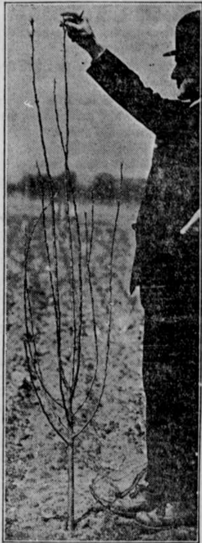
Teaching Tree How to Grow.

A better plan is to cut away only enough limbs to set scion for a good