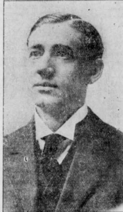
Candidate for Nomination for District Attorney. (Paid Advertisement)