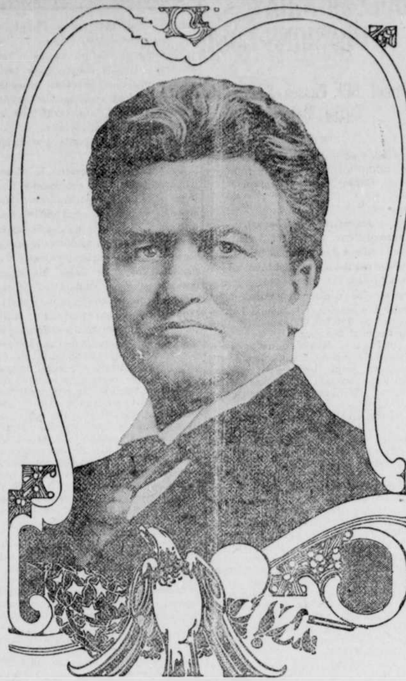
ROBERT MARION LA FOLLETTE

E ARLIEST in the field among "Progressive" Republican candidates was Robert Marion La Follette, senior senator from Wisconsin. His personality as a fighter and "mixer" is sufficiently indicated by the nickname of "Battle Bob," by which he is known among his constituents, a sobriquet which he earned early in his political career. He has been thrice governor of Wisconsin and has served in two congresses as representative. He was elected senator for the term 1905-11 and re-elected for the 1911-17 term. He led the movement to nominate all candidates by direct vote. Prominent among his supporters for the 1912 presidential nomination is Gifford Pinchot, who was the close friend and adviser of President Roosevelt during the latter part of his administration. Senator La Follette received twenty-five votes for the nomination in the last Republican national convention.