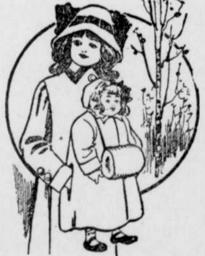
Use Doll for Muff.

A doll that is also a muff, or a muff that is a doll, whichever way you like, has been invented by a New York man. The doll has the outward