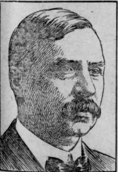
FIGURE IN LABOR DISPUTE