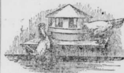
DRINKING PAN FOR POULTRY.

In the construction of a water pan for poultry some provision should be made to keep out dust and litter. The forms shown in the illustration permits fowls to drink from different sides at