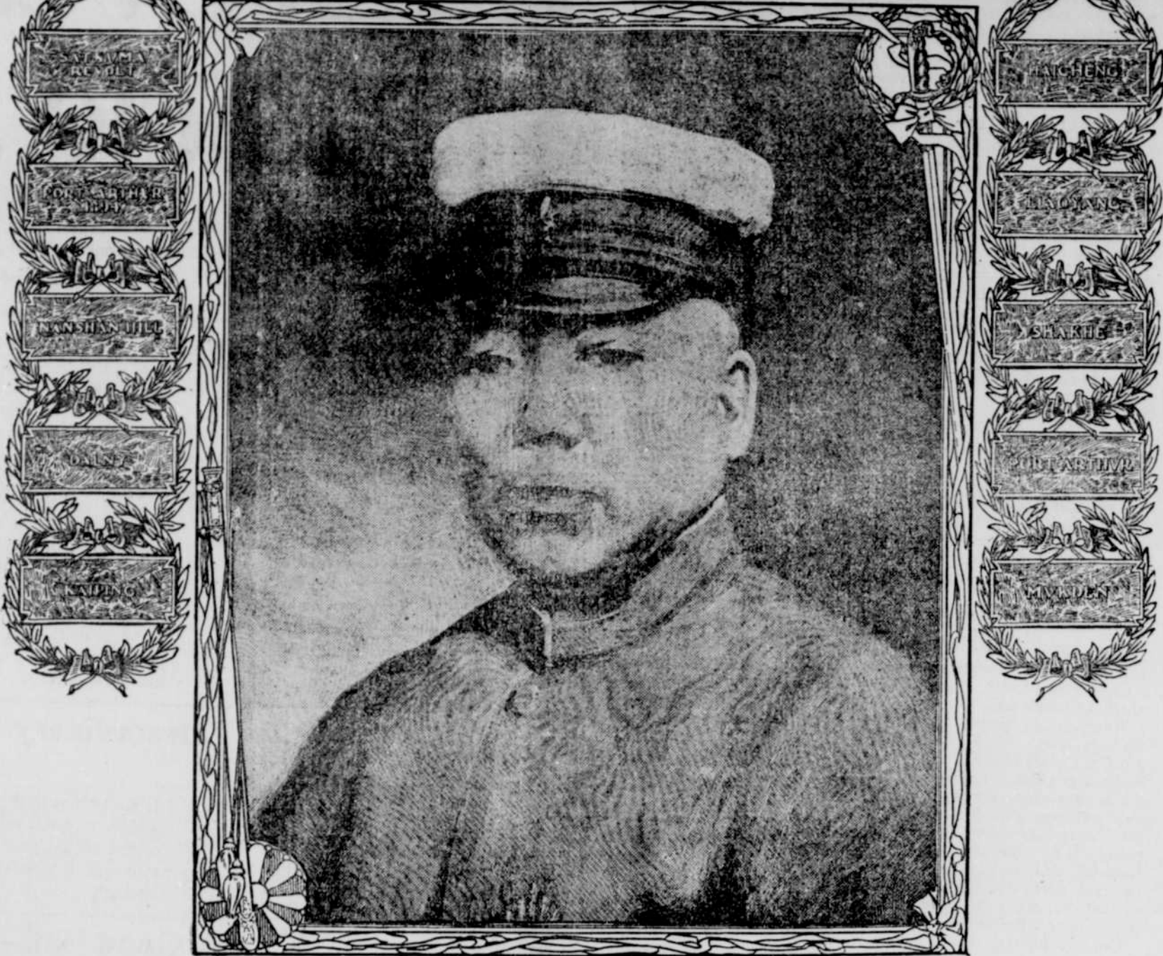
Field-Marshal Marquis Oyama

Field-Marshal the Marquis Oyama, chief of the general staff and commander-in-chief of the Japanese army, is one of the few generals of modern times who may claim to rank among the giants of war who have led troops in the field. The English call him the Wellington of Manchuria, which is the highest praise they can bestow upon any commander, but in European capitals, strategists, amazed by the boldness of a campaign now crowned with complete success, style him the Napoleon of the Orient. It is certain that no general, fighting against a worthy enemy, has achieved so unbroken a series of victories; that none has conceived a more stupendous plan of campaign to execute it so successfully; that none has exceeded the gigantic feat of driving from stronghold to stronghold and finally enveloping a force as big as the army of General Kuropatkin.