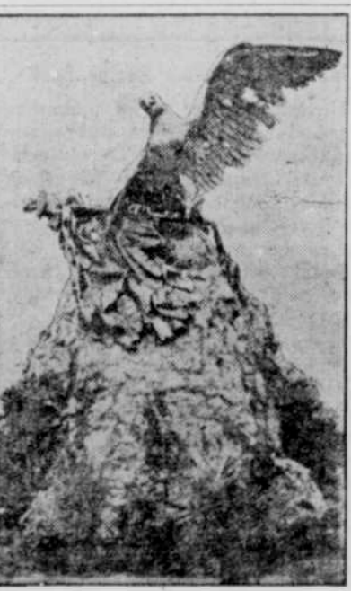
THE WATERLOO MONUMENT.

Monument Erected by France to Her Soldiers Who Fell There. The field of Waterloo, where the star of Napoleon I. forever set in a night of gloom, has been variously marked with monuments by the nations whose soldiers took part in that titanic struggle. No more attractive memorial has been erected, however,