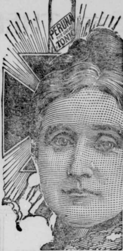
A VICTIM OF LA GRIPPE.