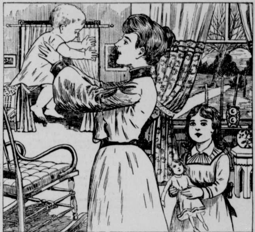
FIND HIDDEN RAG DOLL, SLIPPER AND PIPE.

Every person bringing into our store before next Friday morning, January 22, the correct solution of the above puzzle will be given a reduction of 10 per cent on the first bill of goods purchased of us, regardless of amount.