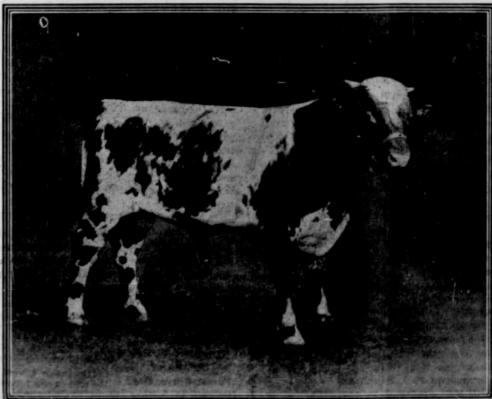
A Possible Prize Winner—One of the blooded animals from the North Yamhill Stock Farm, which will be exhibited at Salem next week.

The Civic Neglect Society is planning a weed show for the near future.