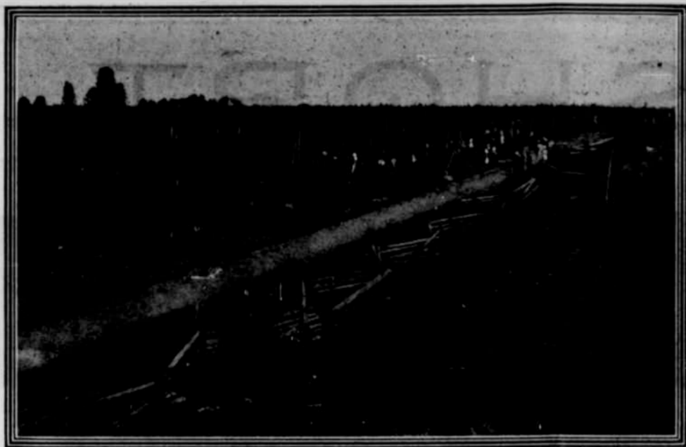
ONE OF THE BIG HOP FIELDS—IMBRIE'S, ON THE TUALATIN PLAINS

For this occasion the Southern Pacific Company will sell tickets to Portland and return, including coupon