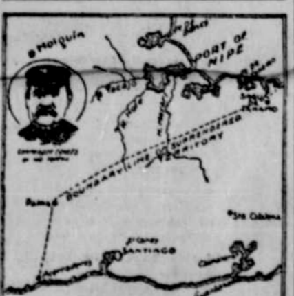
Map showing location of the important port won by the expedition under Commander Cowles.

London, July 30.—According to a dispatch from Berlin, a newspaper there professes to know that the Porto Rican