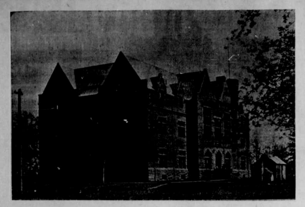
warsh Memorial Hall of Pacific University.