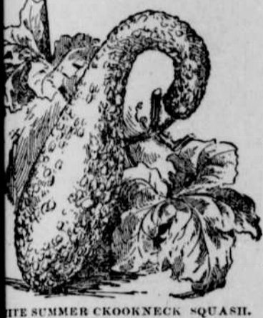
THE SUMMER CROOKNECK SQUASH.

Best Varieties of Squashes. The old Hubbard squash is the standard with farmers and market gardeners.