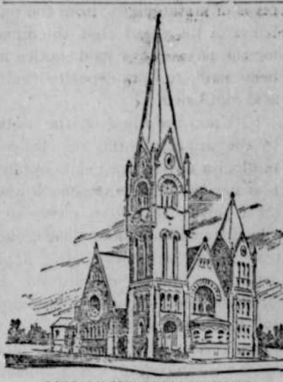
LINCOLN MEMORIAL CHURCH.

The finest church ever built for the use of the colored race is soon to be erected in Springfield, Ill., as a monument to the great emancipator.