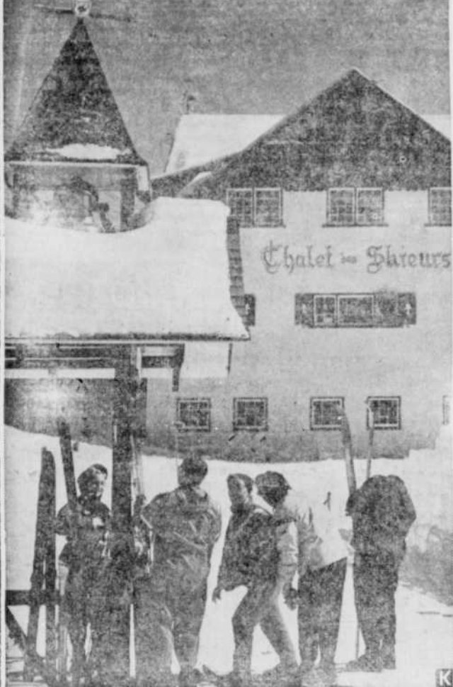
Skiing is the premier activity at resorts all across Canada when winter comes. In British Columbia, Ontario, Alberta and Quebec, countless cozy lodges and chalets near some of the finest ski runs in North America offer a special snowtime welcome. For full details to help plan your winter vacation write Canadian Government Travel Bureau, Ottawa, Canada.