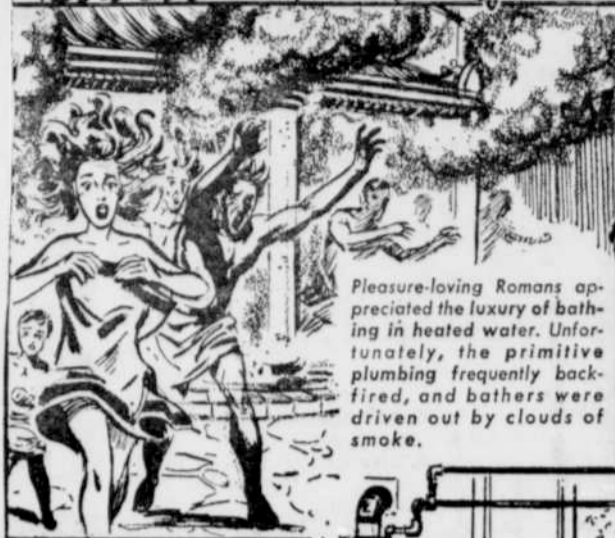
Pleasure-loving Romans appreciated the luxury of bathing in heated water. Unfortunately, the primitive plumbing frequently back-fired, and bathers were driven out by clouds of smoke.