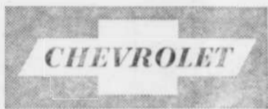
The smart switch is to the '59 Chevy!

the super-softness of Full Coil springing, in Easy-Ratio steering—then you'll know that this is the happiest surprise of the year. Come on in; don't miss this Open House!