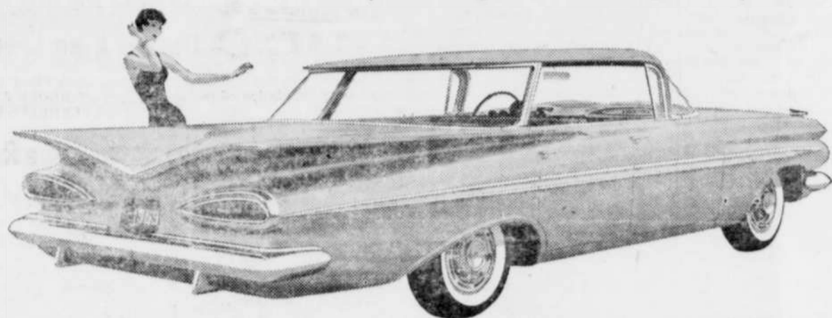
The bright new Bel Air 4-Door Sport Sedan with the same fine, fresh body styling as the most luxurious Chevrolets.

Visit your Chevrolet dealer's OPEN HOUSE (January 22 through 24)