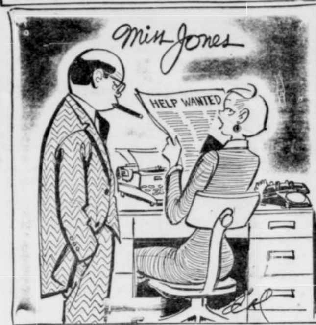
"Oh, I'm not looking for a new job. I'm just checking whether you're trying to replace me!"