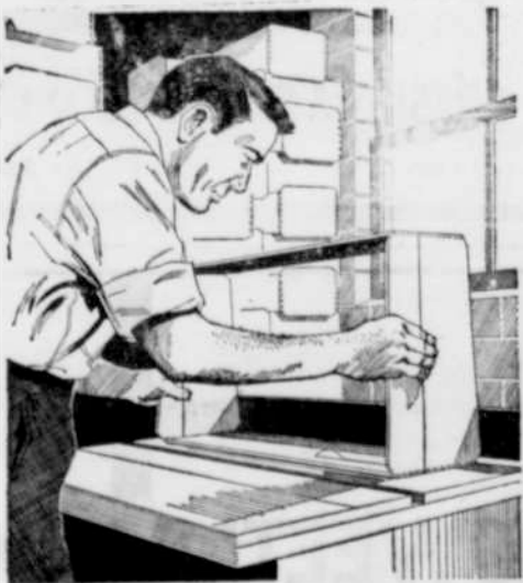
Versatile Ply-Veneer panel stock has many applications other than packaging. Here cut-to-size lock-jointed panels form a core for light weight luggage.

New and diversified products of the forest industry contribute to the economic growth of Washington and Oregon. For as these products are proved and marketed, permanent jobs are created in local communities.