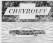
what America wants, America gets in a Chevy!

Here's the car that's definitely new in a decidedly different way. The '59 Chevy is shaped to the new American taste with new Slimline design. It brings you a roomier Body by Fisher, vast new areas of visibility. There's a new Magic-Mirror finish that needs no waxing or polishing for up to three years. A new Hi-Thrift 6 and a wide choice of vigorous V8's. Bigger, safer stopping brakes. An even smoother ride. At your Chevrolet dealer's right now!