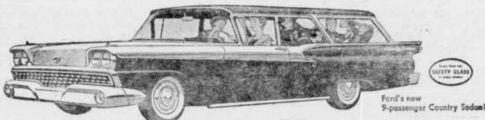
Ford's new 9-passenger Country Sedan