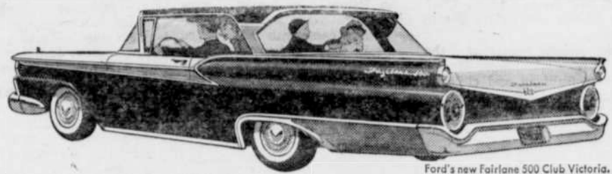
Ford's new Fairlane 500 Club Victoria.