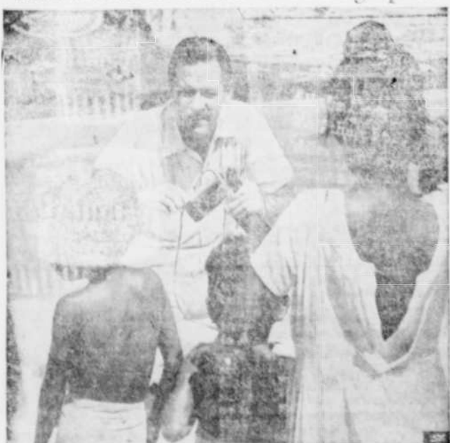
William Holden, who spent six months in Ceylon while making "The Bridge on the River Kwai," photographs native children with his Realist stereo camera. The lush jungle, the picturesque natives, the weird fauna and flora of Ceylon, and the vivid colors enabled Bill Holden to obtain some outstanding three-dimensional color slides.