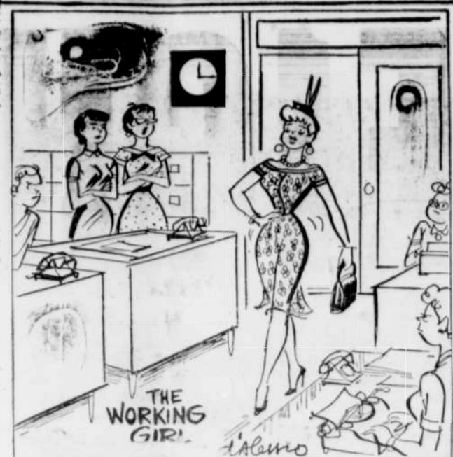
"Well, well, here comes the Duchess, back from her lunch hours!"