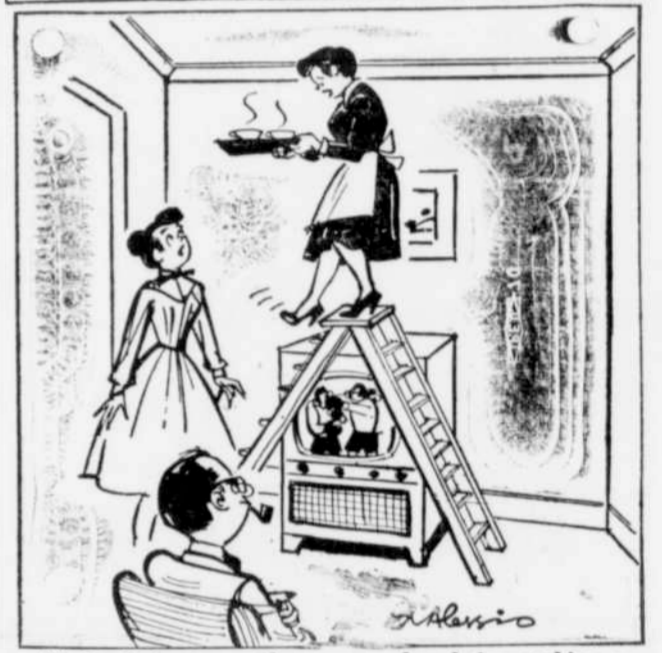
"I don't dare pass the screen when he's watching a fight. He missed a knockout once, that way!"