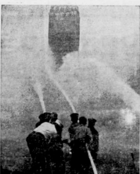
coupled pipe is stored by the Federal Civil Defense Administration in warehouses throughout the nation for use in emergencies. New couplings allow pipe to be laid without leveling it.