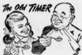
"Growing parents are the only ones suitable for growing children."

Let's get ahead with Estacada. The Upper Clackamas River Chamber of Commerce has a healthy start. If you, as an interested citizen of this area can give the Chamber your support, Estacada can lead the way for more permanent development and prosperity for all.