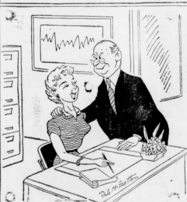
"I'll bet that's what you told all the girls—back in 1921!"