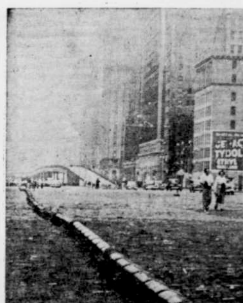
DEMONSTRATION OF PIPE in New York City which can be laid quickly over rough terrain to carry water for fire fighting, city water supply or to pump out flooded areas. This flexible-