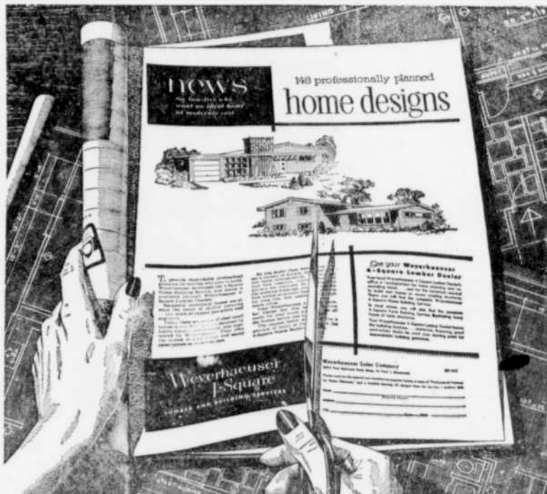
Advertising and sales promotion stimulates the demand for forest products Brand name products build customer-confidence through dependable quality