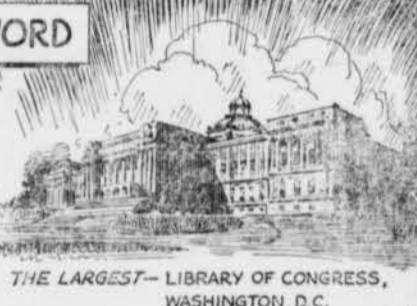
THE LARGEST— LIBRARY OF CONGRESS, WASHINGTON, D.C.

SINCE THE 1760s WHEN THE COLONIES ALREADY HAD 23 PUBLIC LIBRARIES AMERICA HAS TOPPED THE WORLD WITH THEM.—SOME 112 MILLION VOLUMES TODAY.