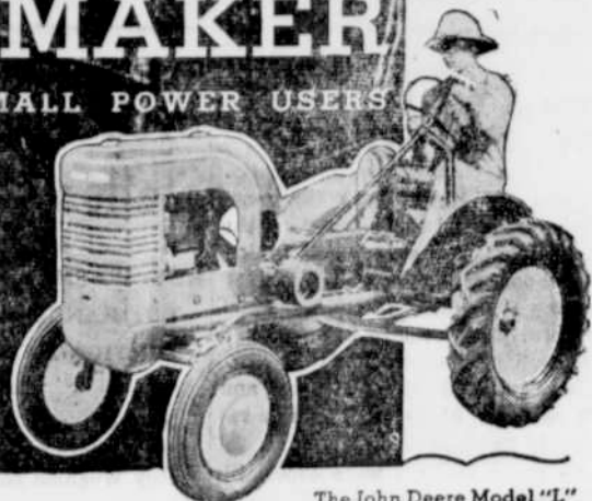
The John Deere Model "L" Tractor

When it comes to year 'round power at unusually low costs, you'll do better with a money-making John Deere Model "L" . . . the tractor designed for the small-power user. Actually, the small, powerful, gasoline-burning engine of the Model "L" burns only about 1/2 gallon of fuel per hour on most jobs.