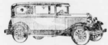
Factory Franchise for 1929 Just Received