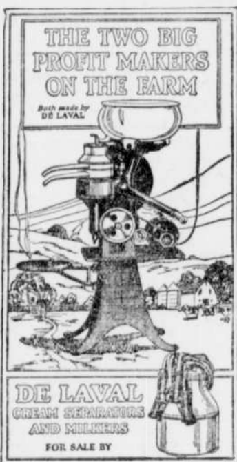
DE LAVAL GREAT SEPARATORS AND MILKERS FOR SALE BY