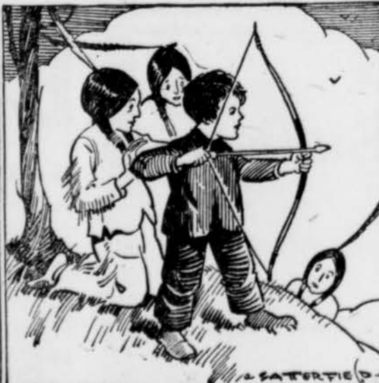
4. The boy's playmates during this visit were little Osage Indian boys, who taught him many Indian sports.