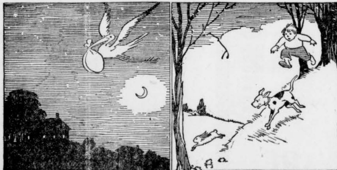
1. On August 10, 1874, Herbert Clarke Hoover was born in West Branch, Iowa. He had one brother and a sister.