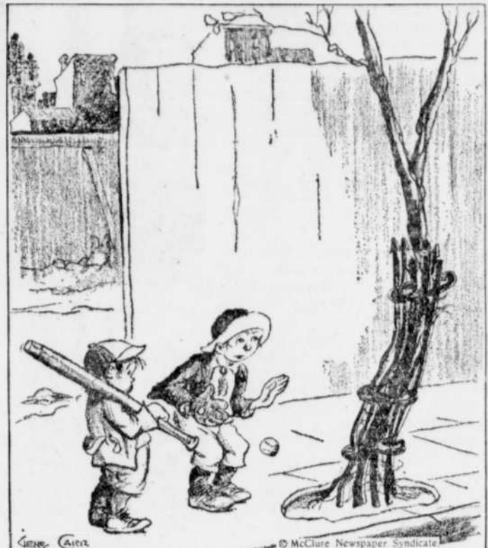
"WHO'S BEEN BATTIN' 'EM OUT HERE?"