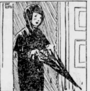
WHY IS DAMP AIR UNHEALTHFUL?