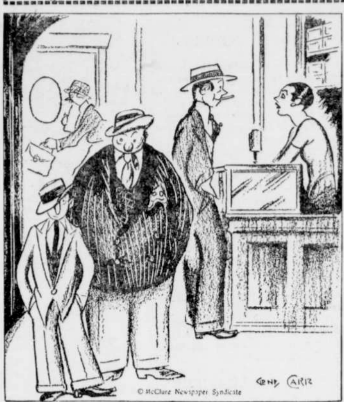
"TH' POOR SAP, HE'S GOIN' TO LOSE A GOOD FRIEND IF HE MARRIES HER!"