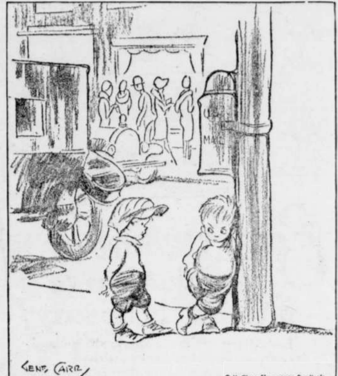
"HOWDY, OL' TIMER?" "K. O., OL' MAN!"