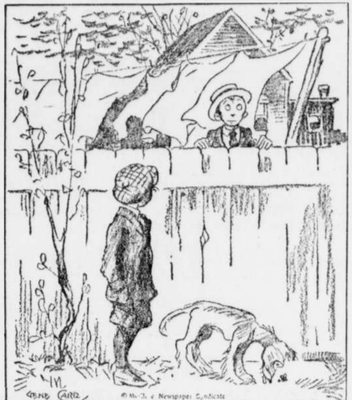
"LOOKA DE MACKEREL SKY!" "YA ALWAYS TALKIN' ABOUT SOMETHIN' T' EATI!"