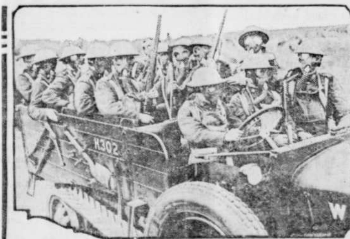
Britain's new war machine, the mechanized force, had its first intensive field training on Salisbury plain recently. Photograph shows gas-masked members of the infantry passing through the gas area.