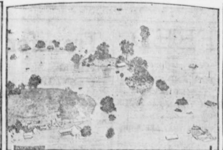
Air view of Indian mounds near Greenville, Miss., that were filled with people and cattle which were driven there when the main levees broke.