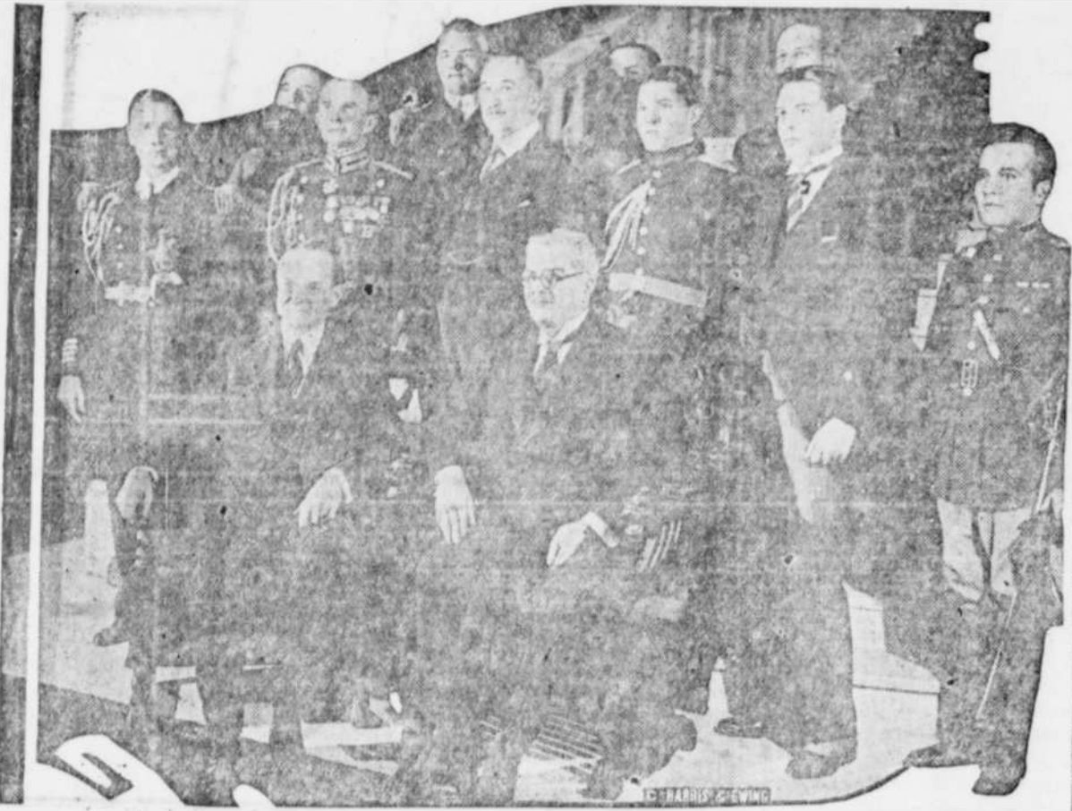
President Coolidge with President Gerardo Machado of Cuba and their aides photographed at the Cuban embassy in Washington where the Chief Executive of the United States paid a return call on Cuba's President. President Machado had previously called on President Coolidge at the White House shortly after his arrival in the national capital.