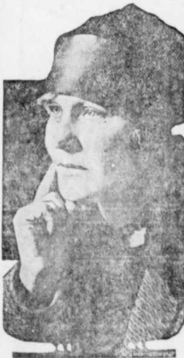
Here is an excellent picture of Mrs. Ruth Brown Snyder as she appeared in the Queen's county (New York) court during her trial on charges of having killed her husband.