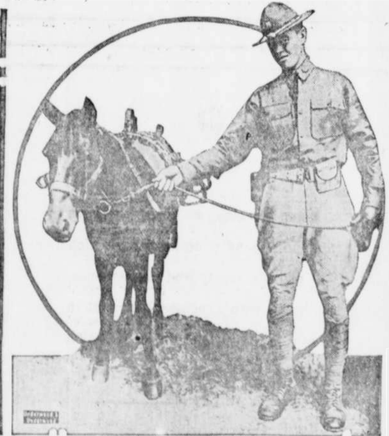
Infantry organizations in the Philippines are experimenting with native ponies as replacements for the time-honored army mules used as pack animals. Lack of roads in many parts of the islands makes transportation by any other means impossible. This photograph shows one of the doughboys with a typical native pony.