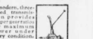
A modern, three-speed transmission provides proper gear ratios for maximum power under every condition.