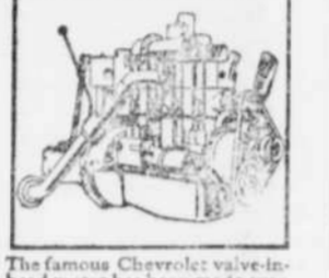
The famous Chevrolet valve-in-head motor has been made even more dependable—with even greater operating economy.