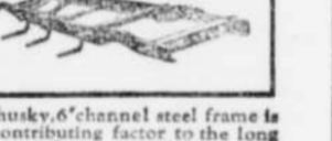
A husky, 6" channel steel frame is a contributing factor to the long life and faultless performance of Chevrolet Trucks.