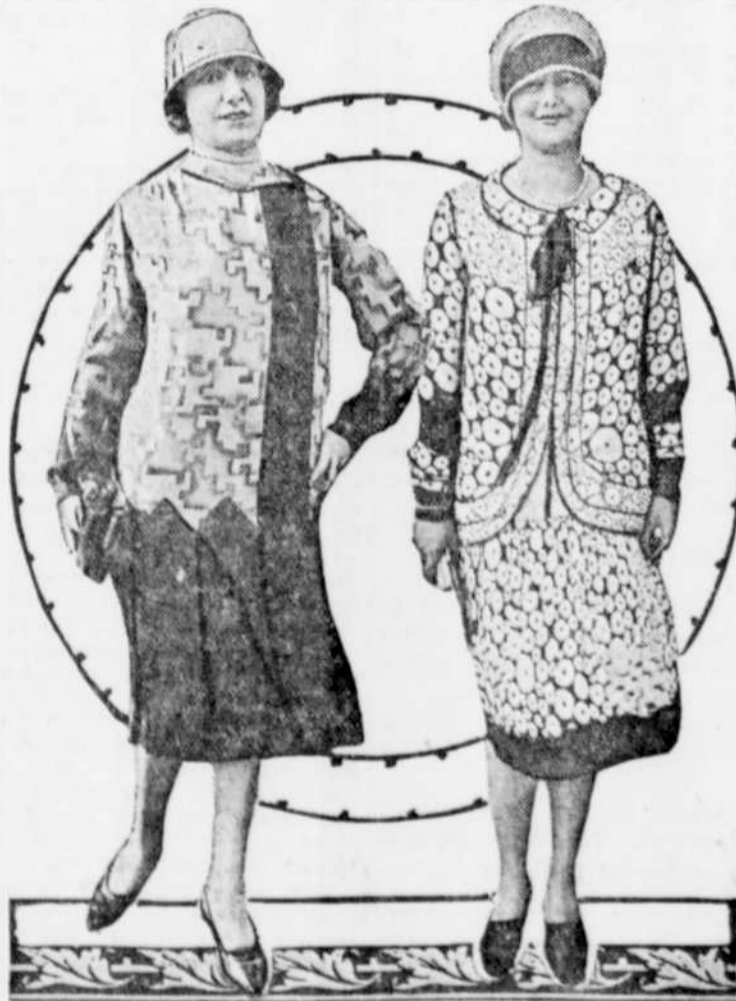
NOVEL TRIM FOR PRINTS

such a fancy to them—they rather challenge the imagination as to what can be accomplished in their fashioning. The attractive Paris-made gown to the right in the picture, does it not capture one's fancy at a glance? Regardless of its air of unsophisticated youthfulness, it reveals the master-touch in every detail. Special attention is called to the wide bandings of solid colored silk which trim each of the frocks in the picture. Using plain with print is a widely exploited feature of the mode. This fashion trend toward using solid with figured is variously interpreted, sometimes by complementing a simple one-piece silk print dress with a short coat of plain silk. This is the ensemble type especially favored by the Parisienne for immediate wear. An elaborate conception of the plain-with-print idea is that of a re-