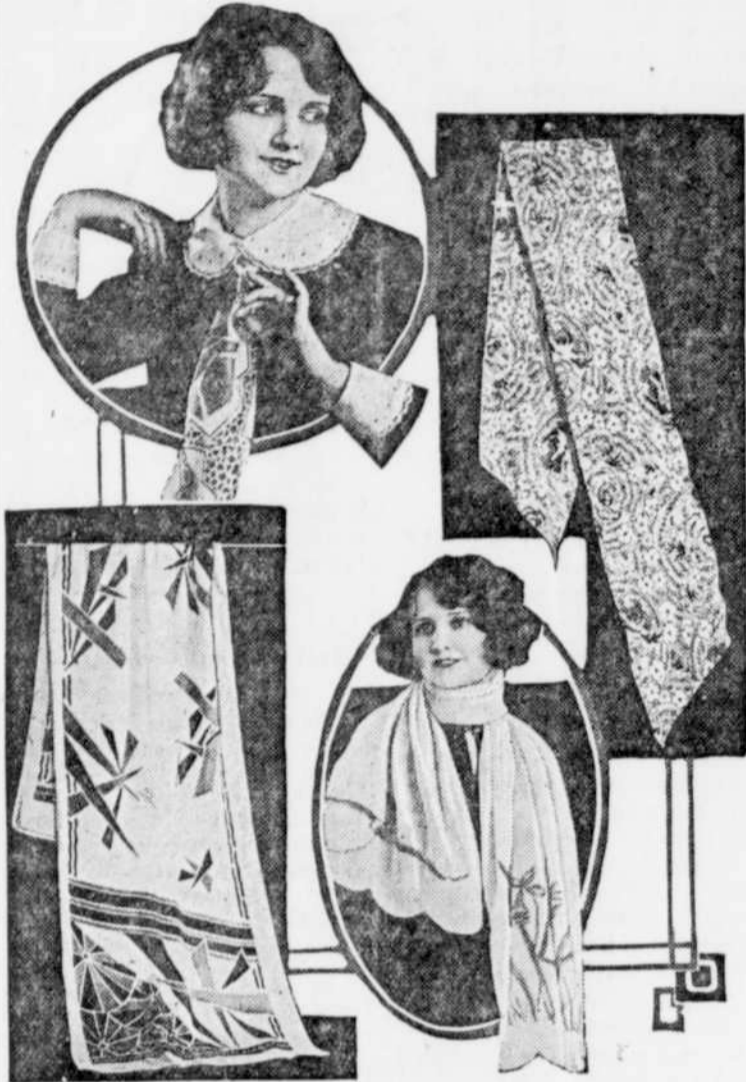
GAY SCARFS AND TIES FOR SPRING

print, if you please. More fashionable than ever are gay print fabrics. It is the tiny patterned prints which are holding the center of the stage at present. Perhaps the debut of these diminutive prints was not greeted with the degree of enthusiasm they merited, but the more we see 'em the more we like 'em. One of the pleasing things about these wee merry-go-round prints is their adaptability to every winsome and cunning styling. Perhaps that is why the couture of Paris have taken