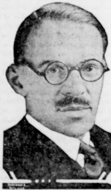
Stokely W. Morgan, who has just been appointed chief of the division of Latin-American affairs in the State department. Unusual importance attaches to Mr. Morgan's position as adviser to Secretary of State Kellogg at the present time because of the crisis in American relations with Mexico and Nicaragua.