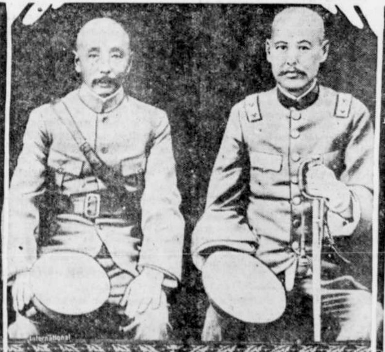
Here, left to right, are Marshal Chang Tso-lin, Manchurian leader, and Marshal Wu Pei-fu, who became "sworn brothers" when they met in Peking last June and planned to fight the Cantonese. Now, current news dispatches say Wu is trying to prevent the passage of Chang's armies southward through Honan province.