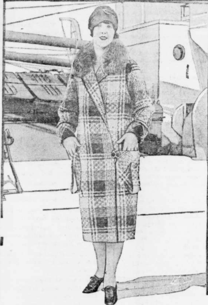
Vogue is for Black and White.

The choice of the Parisienne for the practical hat for immediate wear still rests on felt, and it includes every version from the youthful skull cap types to the imposing tall-crowned ef-