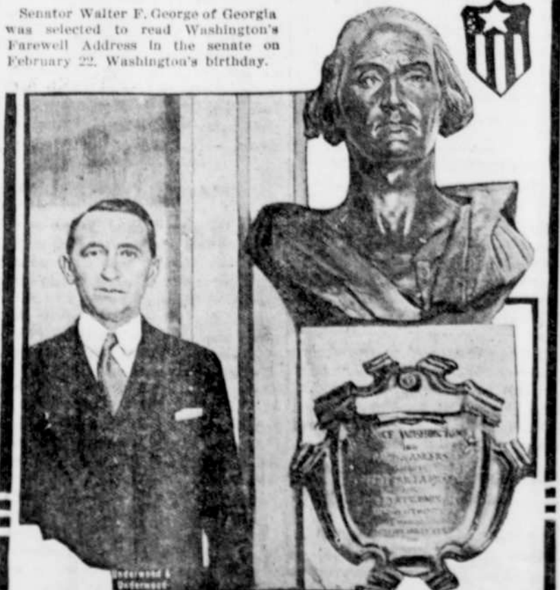
Senator Walter F. George of Georgia was selected to read Washington's Farewell Address in the senate on February 22, Washington's birthday.