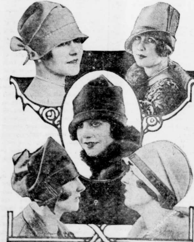
Showing Variety in Crowns.

An outstanding feature of the first model in this group is that the milliner makes part of the hat of felt