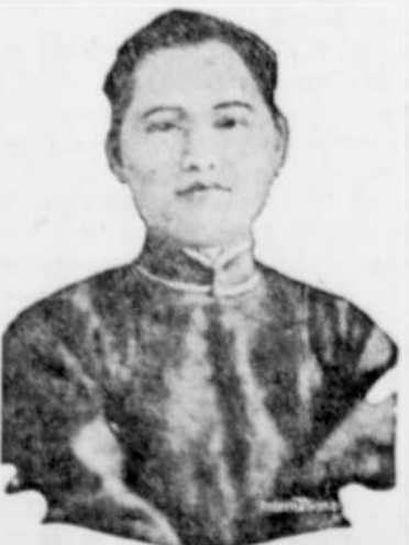
Mrs. Sun Yat Sen, Wesleyan college graduate and widow of the former Provisional President of China, who is said to be leading the Cantonese, or southern forces, in their march northward.