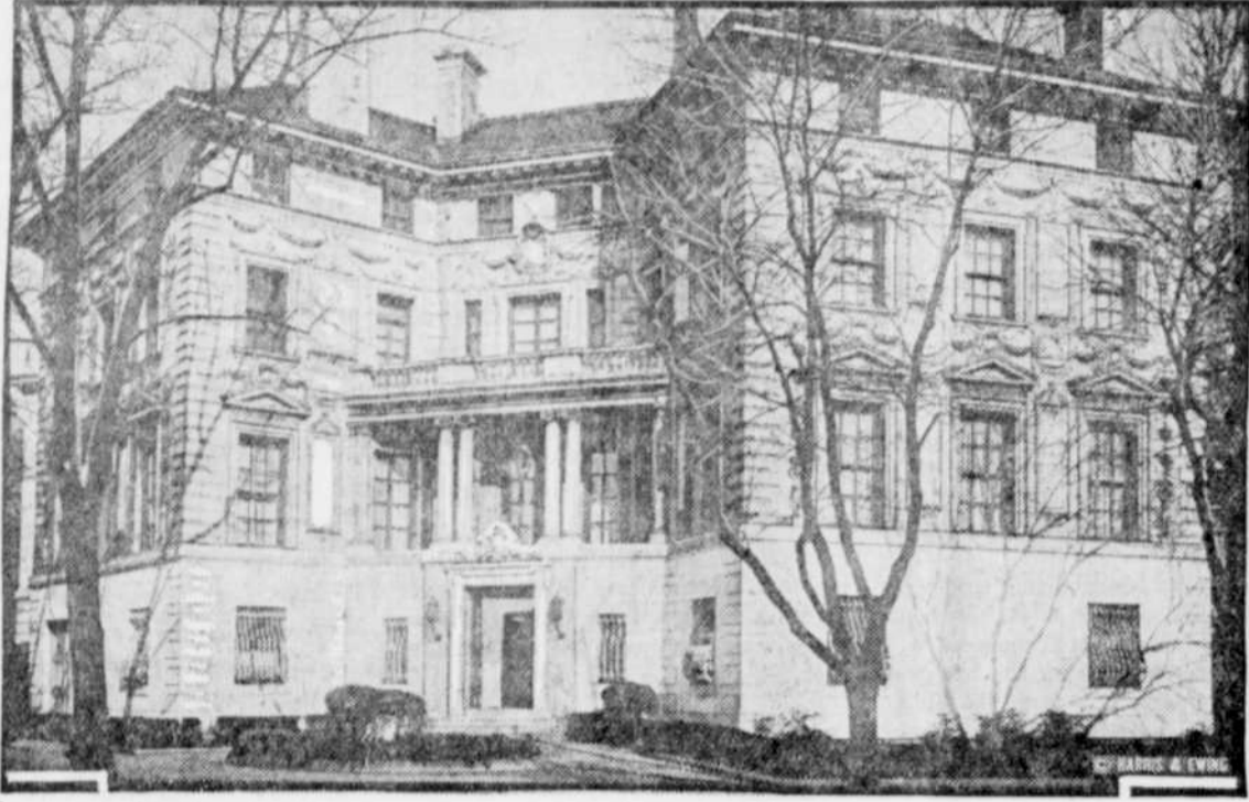
The Patterson mansion, located on Dupont circle in the heart of Washington's fashionable district, has been selected by President Coolidge as the temporary White House while the present one is undergoing repairs starting March 1 and which will take 120 days to complete.