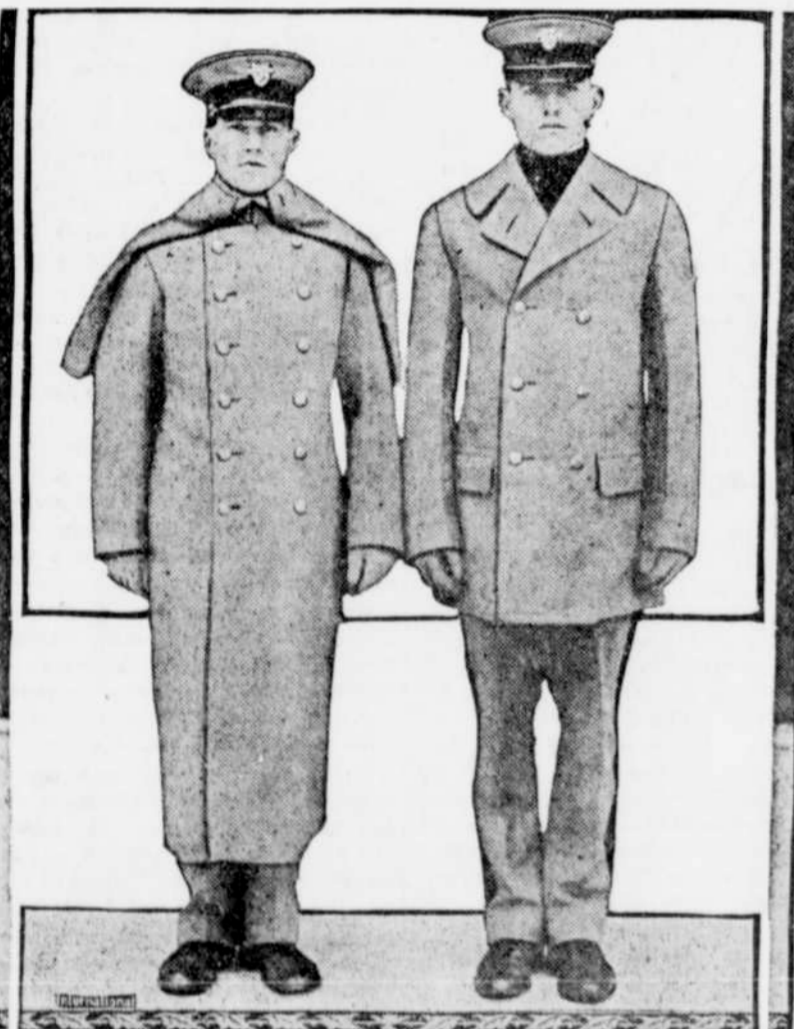
New overcoats, short and gray, made their first appearance recently at the U. S. Military academy at West Point. It does not displace the long coat but is worn when more freedom of movement is desired. Cadets wearing the new and the old coats are seen above.