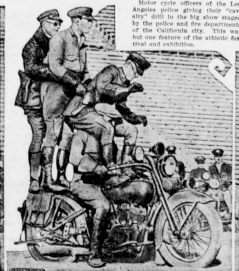
Motor cycle officers of the Los Angeles police giving their "cavalry" drill in the big show staged by the police and fire departments of the California city. This was but one feature of the athletic festival and exhibition.