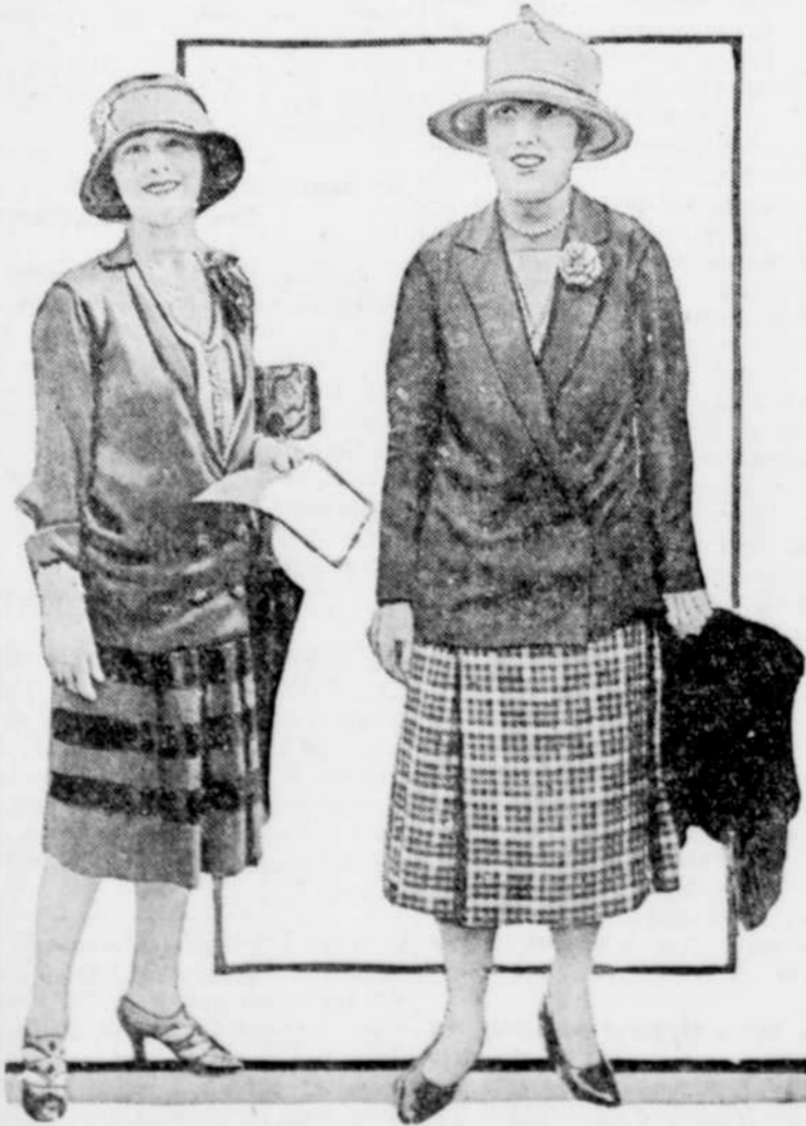
Two Paris Offerings.

Molyneux carries out the jacket costume in velveteen posed over woolen in matching color for the skirt, adding