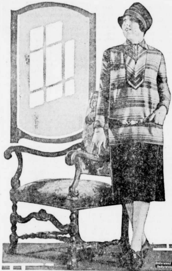
Blouse of Striped Flannel.

Appropriate for the present is the velvet jacket with contrasting skirt, and for later on satin is appointed to take its place. Types such as are shown in the picture are being highlighted by Parisian stylists. Seen at Longchamp was this sports tailleur of