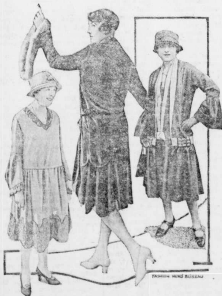
Sleeves Interpret the Style.

Another method of achieving novelty for the sleeve is that of adding cuffs oddly designed and conspicuous because of their hugeness, some reaching more than half-way to the elbow. When the fullness is gathered into