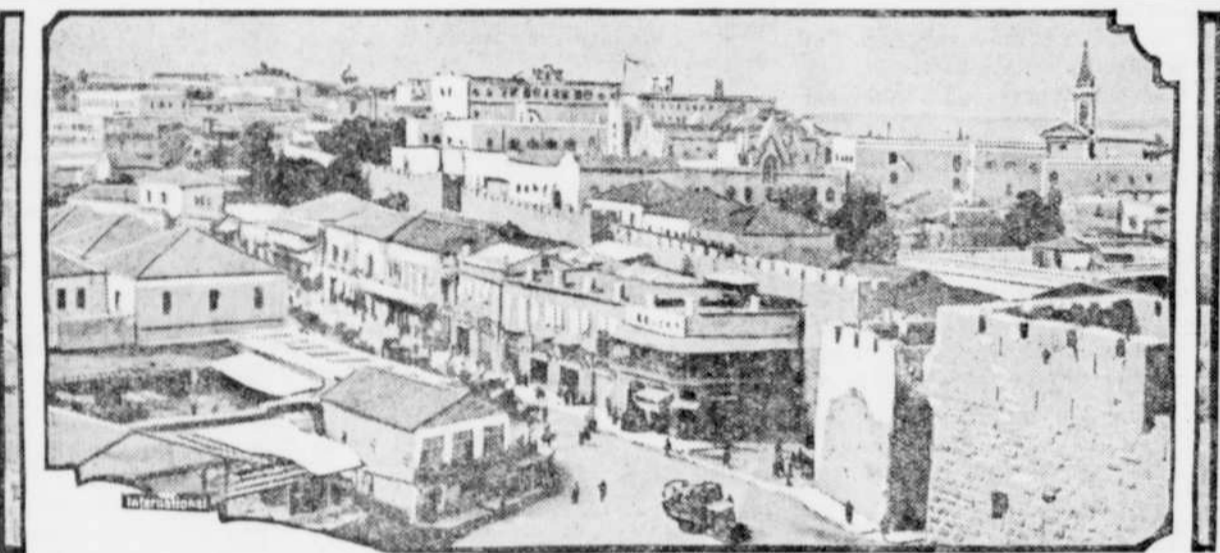
Jerusalem of the Bible contrasts greatly with the Jerusalem of today, as is shown by this photograph of the Jaffa road, looking from David's tower.