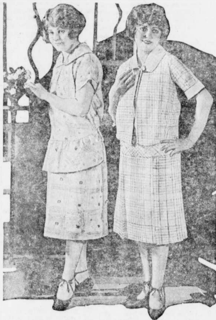
Two Smart Washable Frocks.

arrivals convey the interesting style message that sleeves have again been elected to serve as a foremost interpreter of the mode. Especially is the quaint gracefully flowing sleeve being featured. Because of their unaffected simplicity the new flowing sleeves are of beguiling charm. The naive manner of seaming the lower flowing portion at the elbow, is accented in two of the frocks in this picture. In each instance flat crepe is the selected fabric for the gown. The model to the right adopts the popular redingote styling. Very girlish is the dress to the left, which is in rose-beige trimmed with ribbon ruching.