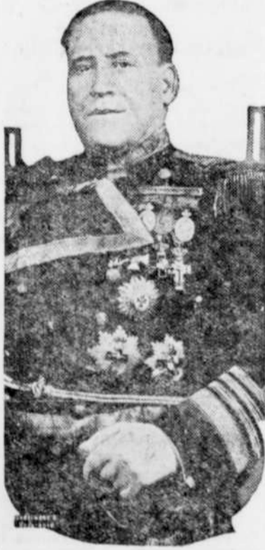
An especially posed portrait of Commander Adolphe H. de Solas of the royal Spanish navy, Spanish naval attache in the United States.