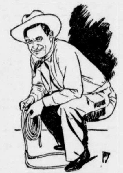
Another "Bull" Durham advertisement by Will Rogers, Ziegfeld Follies and screen star, and leading American humorist. More coming. Watch for them.