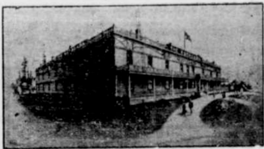
THE ESTACADA HOTEL

THE HOLIDAYS ARE ALL PAST AND AS USUAL ALL ENJOYED THEMSELVES TO THE UTMOST. WE MUST ALL GET DOWN TO BUSINESS NOW. 1926 CAME IN WITH MUCH SUNSHINE AND JOY TO ALL. IN THE FUTURE AS IN THE PAST WE WILL ENDEAVOR TO SERVE ALL OUR FRIENDS AND PATRONS TO THE BEST OF OUR ABILITY AND, SAY, WE EARNESTLY SOLICIT YOUR SUPPORT FOR WITHOUT IT WE CAN'T SUCCEED.