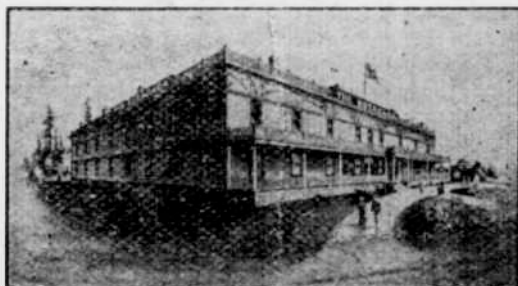
THE ESTACADA HOTEL

A REAL HOME PLACE LIGHTS ALWAYS LIT FIRES NEVER OUT DOOR IS ALWAYS SWINGING BOTH WAYS EXCELLENT SANITARY ROOMS THE TABLE ALWAYS SET ELECTRIC RANGE IS HOT IN THREE MINUTES